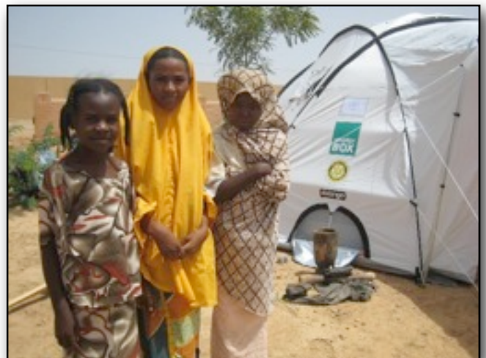
ShelterBox on the ground in West Africa

me, and I will handle all the paperwork for you. Please mail donations to me at 1030 Third Street, San Rafael, CA 94901.” ♦